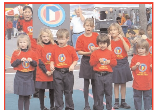
Singing, Festival of Nations

Spanish | Mathematics | English | Science | Mandarin | History