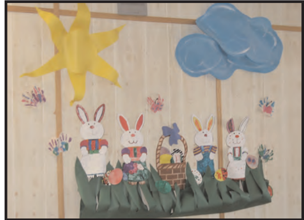
PCRS decorations at the Rescue Mission

Wed May 16 Last Day of School. End of the Year Party.