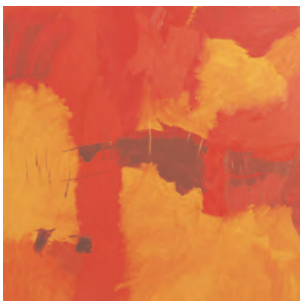
My Corona, Troxel

The children are reading in Mandarin well and have a vocabulary of about 350 words. In English the children are confident readers and feel comfortable spelling many words. We are also thrilled about the math progress, the students can now handle addition and subtraction within 100. They also have finished all 30 science topics.